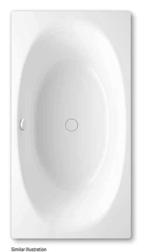
To order the bath with pre-drilled grip holes on one side, please order model xxxx 1011 xxxx.